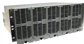
Typical 18kW 19" Shelf